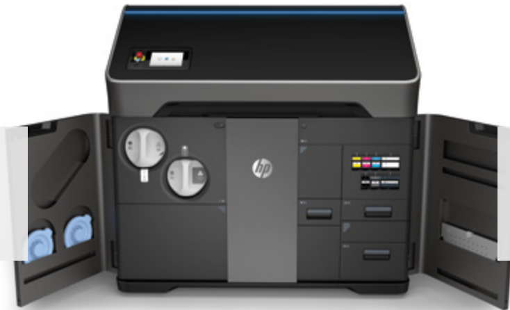
Image shows the HP Jet Fusion 580 Color 3D Printing Solution

HP Jet Fusion 540/340 3D Printers 4-agent configurability