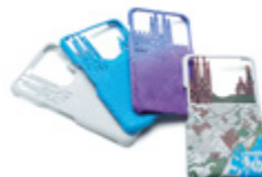
Data courtesy of FreshFiber